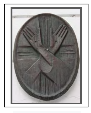
Hands with stigmata