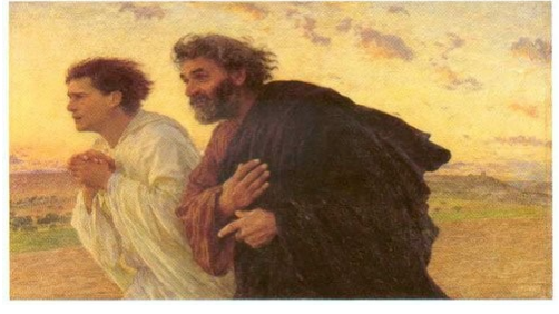
got ready to send them out two by two..." (Mark 6: 7-13)

"He called his 12 followers together and