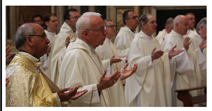
Australian bishops celebrate Mass at the Basilica of St Mary Major in Rome yesterday

BISHOPS TACKLE BIG ISSUES ON AD LIMINA VISIT Published: 26 June 2019