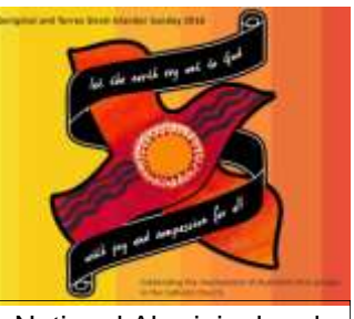
National Aboriginal and Torres Strait Islander