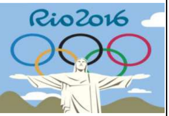
We prav for the safety and success of the Rio Olympics, and for a deeper awareness of the poverty and struggles of the people of Brazil and beyond