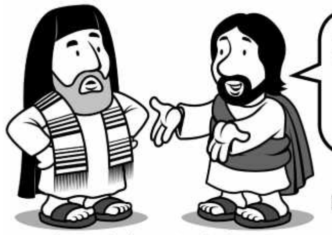
Find out what Jesus said to the pharisees using the words to fill in the blanks.