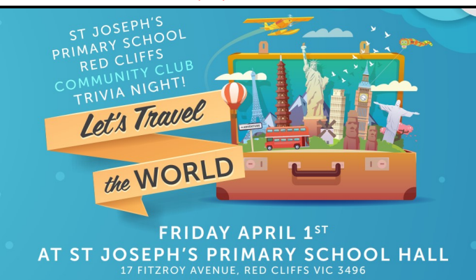
Tickets can be purchased for $20 by contacting Naomi at the school on 50241654.