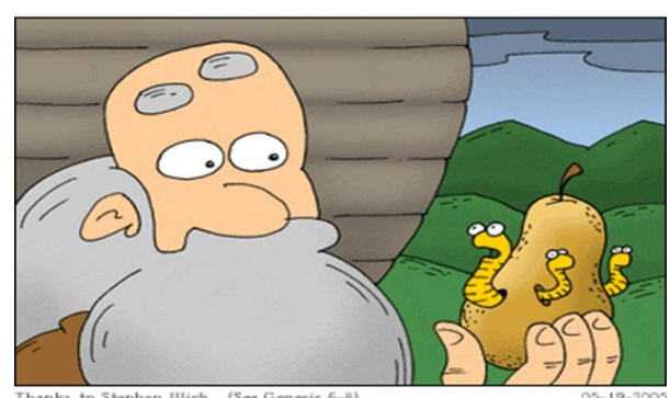
WE WERE TOLD YOU WERE TAKING CREATURES THAT CAME TO YOU IN PEARS