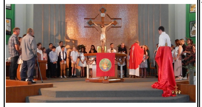
Saturday 10th November