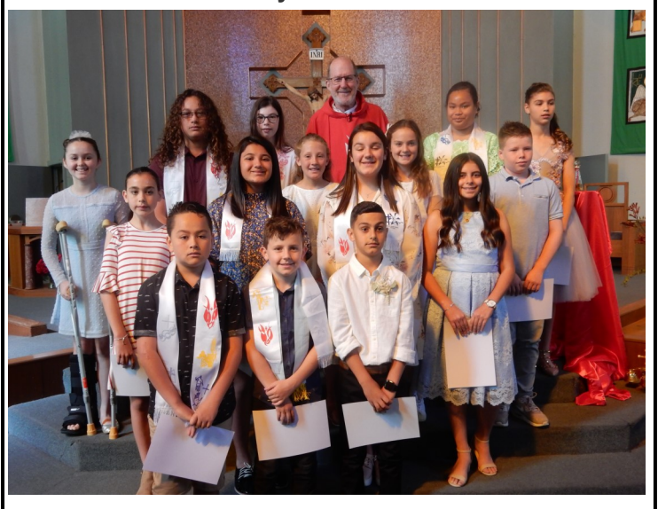
Sunday 11th November