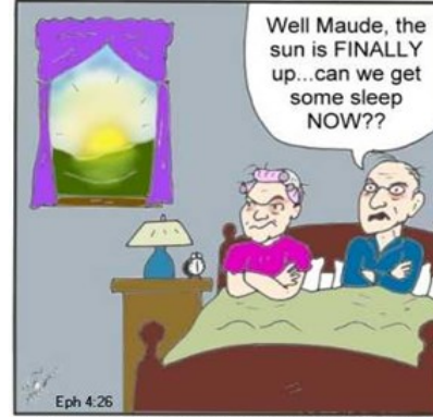
"Do not let the sun go down on your wrath." Letting it come up on your wrath isn't good either