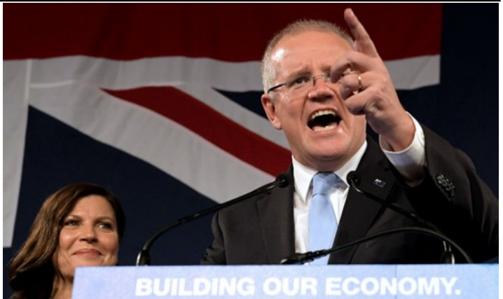
SECURING YOUR FUTURE

Social licenses are required because human beings matter: not because they are wealthy, white, liberal or right-thinking, but simply because they are human and because they depend on one another to live human lives. For that reason the fourth priority facing government is to support the most disadvantaged and disregarded in society. In Australia these include especially Indigenous people and those who seek protection from persecution.