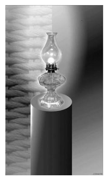
Affirmation or Challenge

The salt and light of the world passage is often used to affirm and encourage, but when Jesus tells his disciples – and us – to be salt and light of the world it is not so that they can draw attention and glory to themselves. The whole purpose of being salt and light is to lead others into right relationship with one another and with God. Whilst the translation we have clearly states that disciples are to be salt and light of the world, it is just as clear that the intention is that they/we be salt and light for the world.