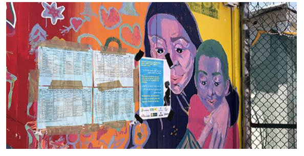
A mural at a refugee camp on the Greek island of Lesbos

Pope Francis has urged society to drop scepticism and prejudice towards migrants and newcomers, calling the attitudes racist. Source: Crux.