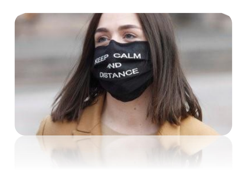
There will be no return to a pre-COVID world; it has changed forever

Victorians have been in exile from the homeland of our humanity for six months now. Throughout this exile, hope has been hard to come by as fear, fatigue and frustration have taken hold. Now, a way out of captivity has been set before us. Every Victorian has an interest in the government's road map towards a "COVID-normal" destination. But what do we actually want that destination to look like, and how might it shape the road ahead?