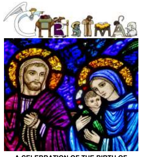
A CELEBRATION OF THE BIRTH OF JESUS, THE SAVIOUR OF HUMANITY

6-7pm, at Horsham Church; Prayers for the World, Australia & our Church for the New Year.