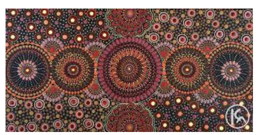
At St. Brendan's we pay our respects to the traditional owners of the land, the Gulidjan people and pay our respect to their Elders past, present and emerging. We will respect the land, animals and waterways, from the roots of the earth to the tops of the trees. Through the example of our first Australians, we understand that if we look after the country, then the country will look after us.