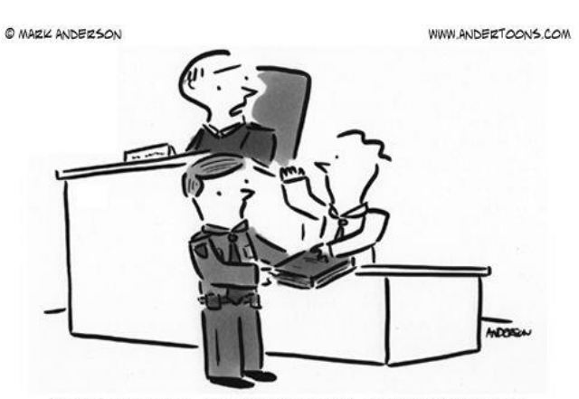
"It's 'the truth, the whole truth, and nothing but the truth.' It's not a multiple choice question."