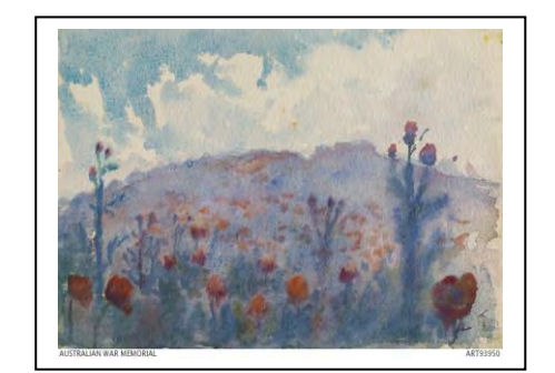
A sketch of wild poppies growing in front of Mont Kemmel