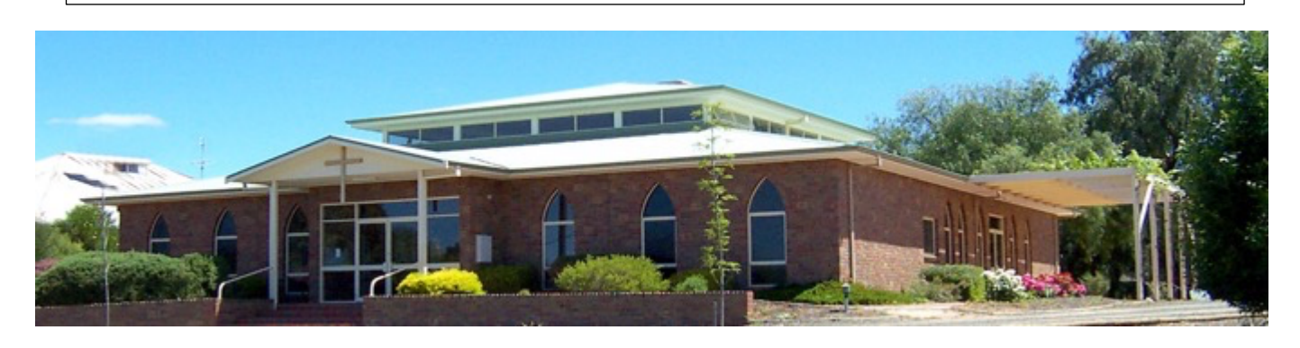
The Second Sunday of Lent, Year B