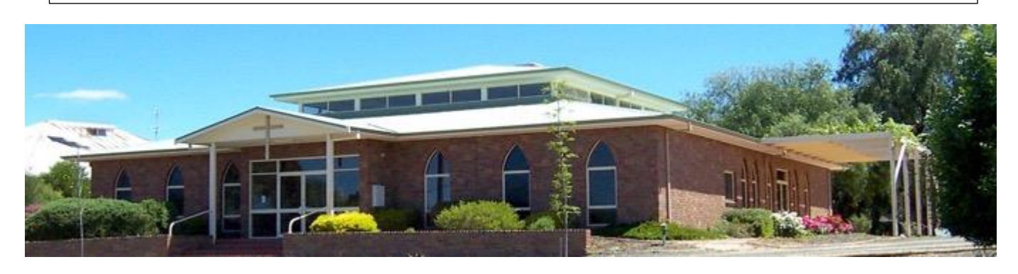
The Sixth Sunday of Ordinary Time, Year B