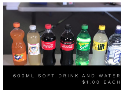
600ML SOFT DRINK AND WATER $1.00 EACH