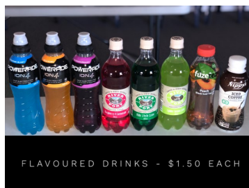
FLAVOURED DRINKS - $1.50 EACH

All jams and pickles have been hand-made. You can pick and choose your jam/pickle to go in your basket. It makes a great gift!