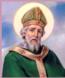
St Patrick's, Stawell