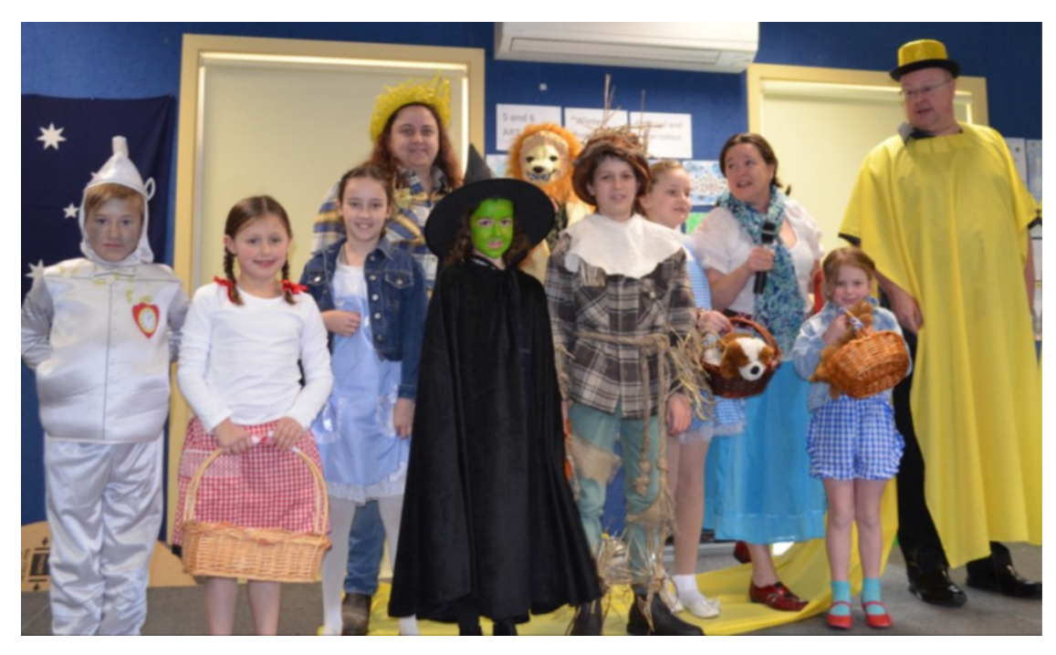
Book Week (last Friday) at St. Mary's saw a visit from the Yellow Brick Road and Dorothy Snr with most of the cast from the Wizard of Oz!