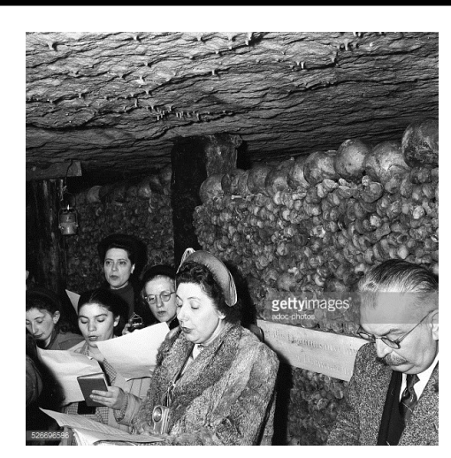
Mass in the Catacombs of Paris—1951