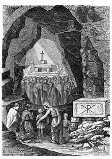
Early Christians celebrating Mass in the Catacombs.