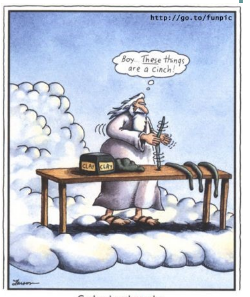
God makes the snake