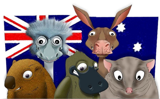
Celebrate Australia Day Australia Day - 26 January

In bible times the shepherds were considered by many to be of less worthy social standing. They were marginalized by the social and religious elite. In 2017 we still have "shepherds" who are less worthy of sanctuary in our country, less worthy of our company, less worthy of a place in line for holy communion. In 2017, in St Mary's Parish, we are committed to the eradication of the "shepherd", to the eradication of the label "less worthy."