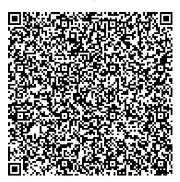
Location code RE5 ZWJ

You will need to have downloaded the APP onto your phone. It will not work if you just take a "photo" of the image above. There will be someone to help. But we would urge you to come 10 minutes earlier to Mass if you are unsure of what to do.