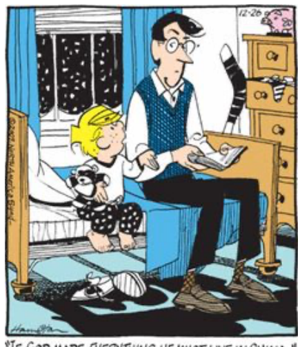
*IF GOD MADE EVERYTHING, HE MUST LIVE IN CHINA."

*We are no longer required to check the vaccination status of those attending places of worship. *Quotient requirements are no longer in force. *Masks are mandatory at the moment but that can change so please be aware *QR code check-ins are required.