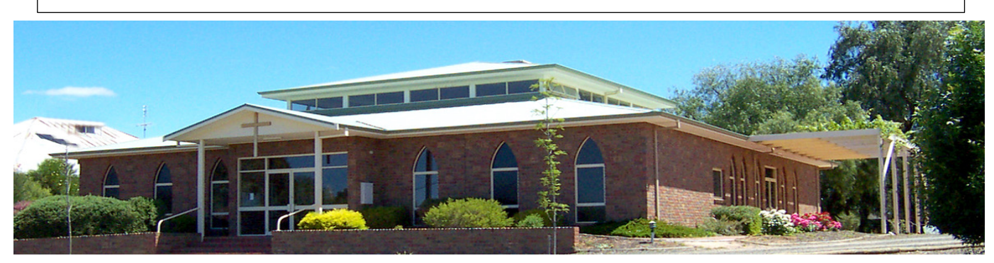
Third Sunday in Ordinary Time C

OUYEN, PATCHEWOLLOCK, TEMPY, WALPEUP, UNDERBOOL