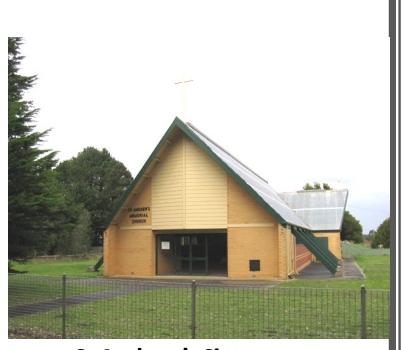
St Andrew's Simpson

Dear Friends Easter gives hope to the people who live in the state of hopelessness.