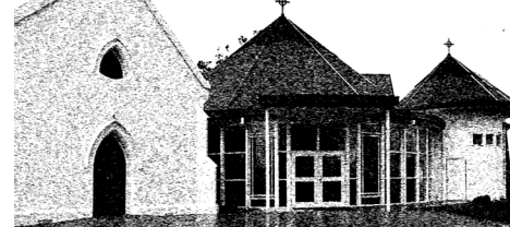
SS Peter & Paul's Church 701 Fiskens St Buninyong