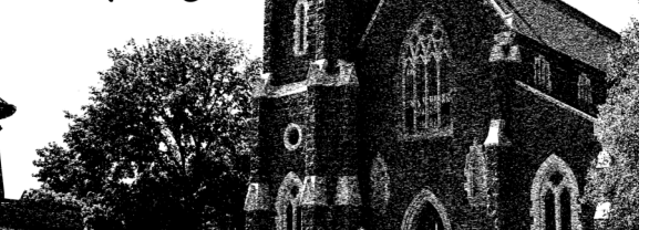
St Alipius' Parish Church 82 Victoria Street, Ballarat East 3350