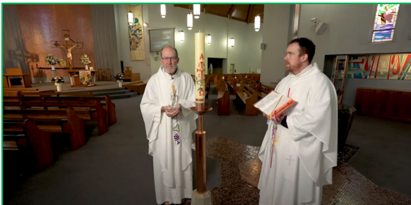
Sacred Heart Parish, Mildura Masses can be viewed here .

As a parishioner, I find it both comforting and reassuring to see our own priests celebrating Mass and giving meaningful homilies while we can't be present at Mass in the church. It maintains a link to normality while we are experiencing social isolation. We are so blessed.