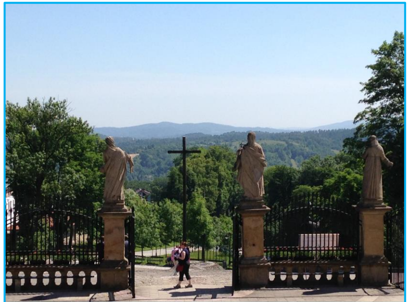
Left: Young people pray the Stations of the Cross at the Calvary Monastery (Kalwaria Zebrzydowska) in Poland Right: Kalwaria Zebrzydowska - a popular pilgrimage and retreat centre in Poland