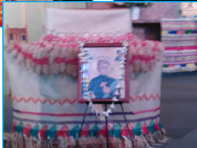
Decorated Shrine to St Peter Chanel