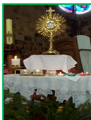
Exposition of the Blessed Sacrament Online