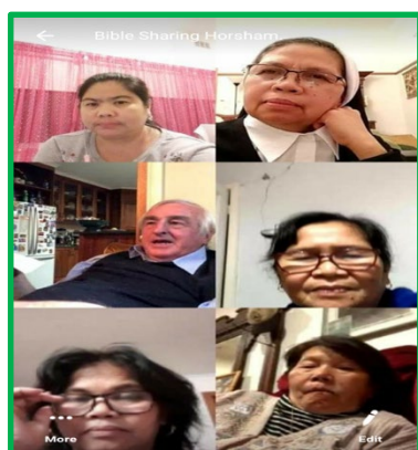
Bible sharing online

Diocesan RCIA & Sacramental Facilitator Co-ordinator and a member of the Horsham Parish.