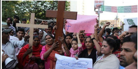
Christian protest in Karachi

An imminent attack on Christians should be expected in Pakistan, according to the country's military, reports The Tablet .