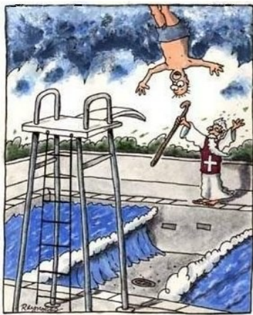
Moses' first and last day as a lifeguard.

Children and the Toilet –Just a reminder that all children MUST be accompanied by an adult when going to the toilets during Mass. This is for the safety of the children.