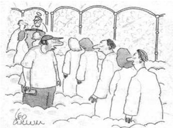
"Pssst!... Two passes... Best prices."