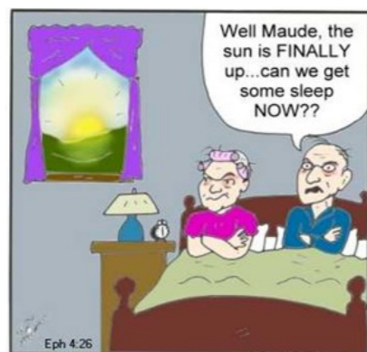
"Do not let the sun go down on your wrath." Letting it come up on your wrath isn't good either.

Saint of the week: St. Patrick of course! Born 387, Died 461, St. Patrick of Ireland is one of the world's most popular saints. He was born in Roman Britain and when he was fourteen or so, he was captured by Irish pirates during a raiding party and taken to Ireland as a slave to herd and tend sheep. At the time, Ireland was a land of Druids and pagans but Patrick turned to God and wrote his memoir, The Confession . In The Confession , he wrote: "The love of God and his fear grew in me more and more, as did the faith, and my soul was rosed, so that, in a single day, I have said as many as a hundred prayers and in the night, nearly the same. I prayed in the woods and on the mountain, even before dawn. I felt no hurt from the snow or ice or rain." Patrick's captivity lasted until he was twenty, when he escaped after having a dream from God in which he was told to leave Ireland by going to the coast. There he found some sailors who took him back to Britain and was reunited with his family. Happy St. Patrick's Day for March 17th!