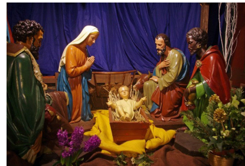
Photo: The complete Hipster Nativity set

"Amazingly, a lot of people seem very concerned about the proper definition of a millennial and a hipster, too. We get comments like: 'Segways aren't hipster. They're technically early-stage millennial with a tinge of East Coast liberal.'"