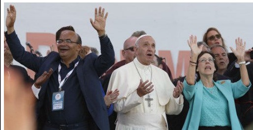
Pope Francis at Charismatic Renewal vigil in Rome

Huge numbers of singing, clapping pilgrims in bright red baseball caps, descended on Rome over Pentecost to celebrate the 50th anniversary of the Catholic Charismatic Renewal (CCR), Austen Ivereigh reports in Crux.