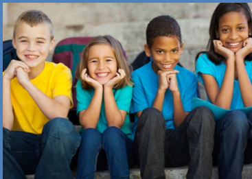
Creating a Safer Victoria for children

Standard 7: Strategies to promote the participation and empowerment of children