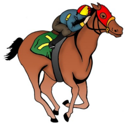
Melbourne Cup Day!

Monday November 6: Cup Eve Cards at St Joseph's Hall, Yambuk. 8.00pm Start.