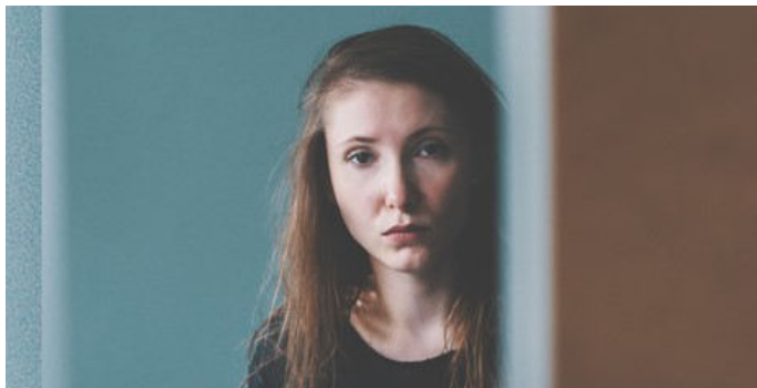
Today, Sunday, is The International Day for the Elimination of Violence Against Women

Australian Church leaders are backing Pope Francis' condemnation of domestic violence and are encouraging Catholics to help eradicate violence against women – which has claimed dozens of lives this year.