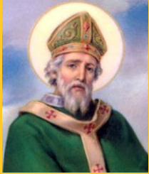
St Patrick's, Stawell