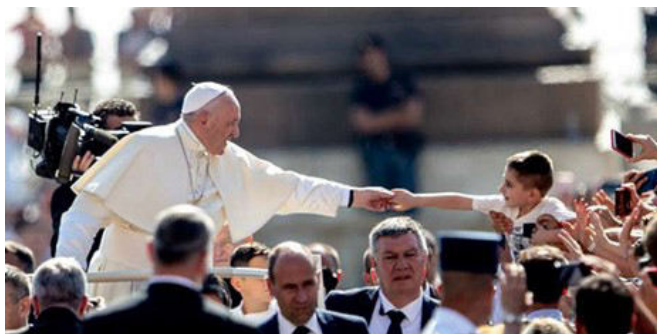
Published: 10 June 2019

The Holy Spirit unites and grows the Church despite human limitations, sins and scandal, Pope Francis said yesterday. Source: CNA.