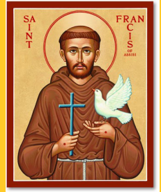
St Francis of Assisi, Landsborough