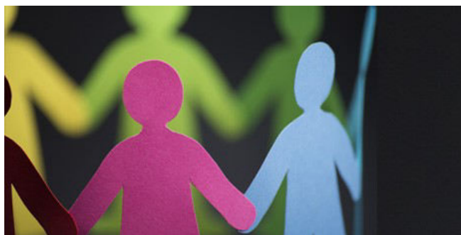
the national guidelines will be a focal point for the Church's work in keeping children and vulnerable adults safe

The Church is developing new national policy guidelines to strengthen and standardise Church authorities' responses to historical and contemporary concerns and allegations of abuse of children and vulnerable adults. Source: ACBC Media Blog.