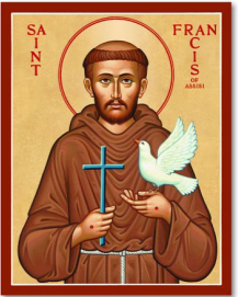
St Francis of Assisi, Landsborough