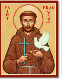
St Francis of Assisi, Landsborough