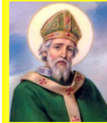
St Patrick's, Stawell