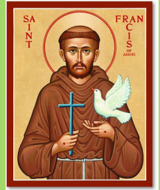
St Francis of Assisi, Landsborough