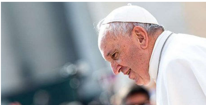
Pope Francis in St Peter’s Square yesterday

An important aspect of the Christian life is obeying God even when there may be consequences for going against the commands of others, Pope Francis said yesterday. Source: CNA.