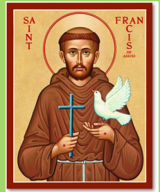
St Francis of Assisi, Landsborough