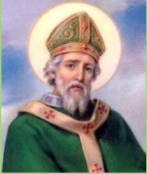
St Patrick's, Stawell