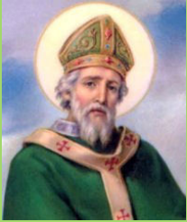
St Patrick's, Stawell