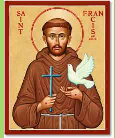
St Francis of Assisi, Landsborough