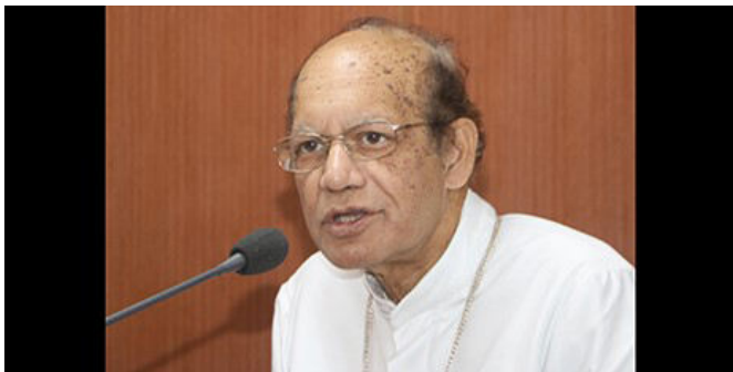
Cardinal Oswald Gracias

Catholic bishops are not fully utilizing Church law to maximize the role of women in decision-making capacities, Indian Cardinal Oswald Gracias of Mumbai said yesterday. Source: Crux .