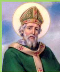
St Patrick's, Stawell